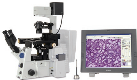
Figure 2 | Olympus CellCut Plus with PenTouch monitor.